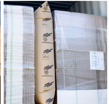
Inflated in position