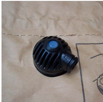
Flex valve 360° rotation