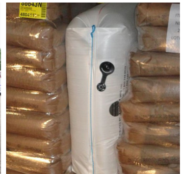
Optimum contact between airbag and load