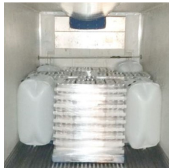
Securing single pallets