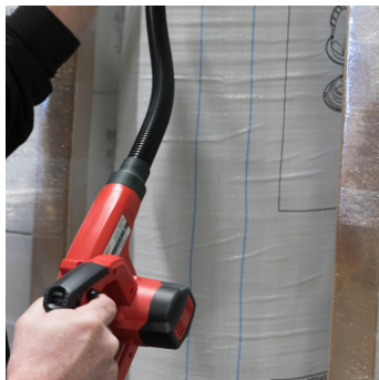
Inflation with compressed air or portable blower systems.