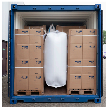
Inflated in position